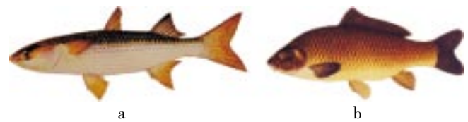
Figure 2. Two studied fishes.